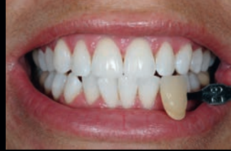
After Enlighten Whitening